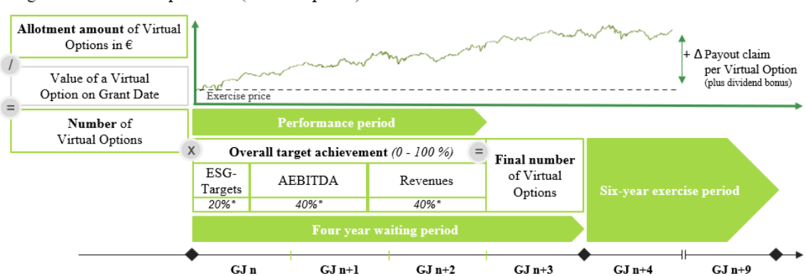
Long-term variable compensation (Virtual Options)

the long-term variable compensation issued in the reporting period in the form of Virtual Options is summarized in the following illustration, with ESG targets being used as additional performance criteria when granting long-term variable compensation since a Supervisory Board resolution of April 15, 2021: